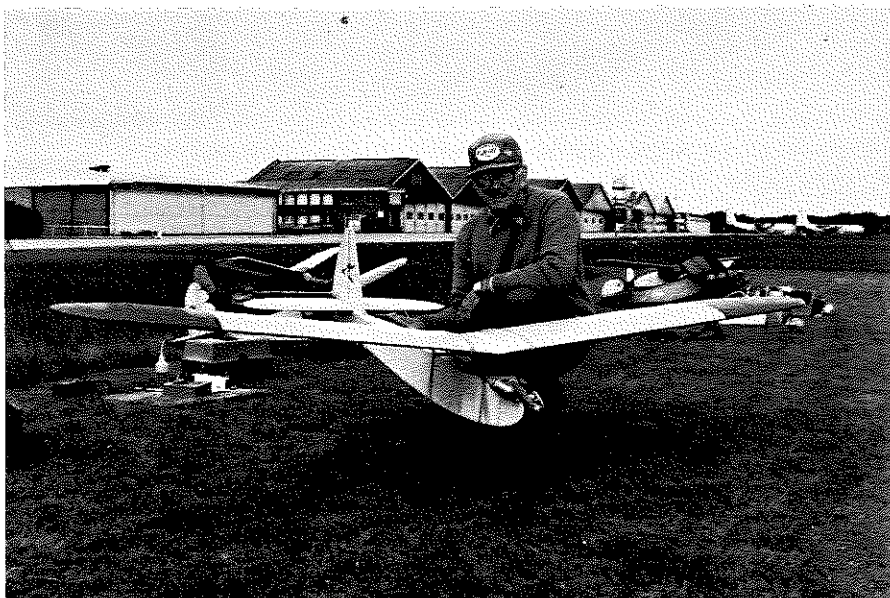
14. Well-made Carrol Krupp Bowden Winnder by Ford Lloyd, Melbourne, Australia. Lucky boys fly from the local airport.