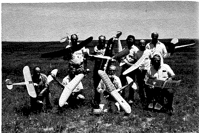
11. Group of SAM 1 modelers who competed in the annual 1/2A Texaco Postal Contest for '87. See text for names.