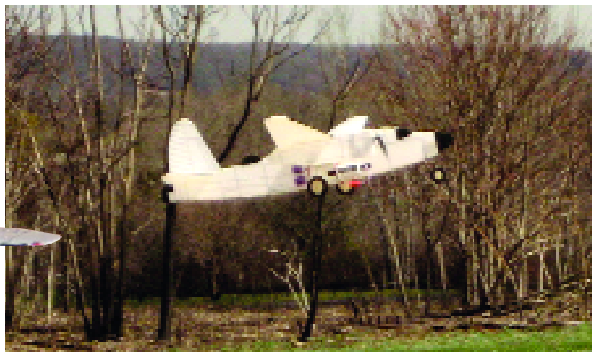
The B-26 climbs out just after liftoff. Notice how the foam-board wings bend slightly under the load, giving extra dihedral angle.