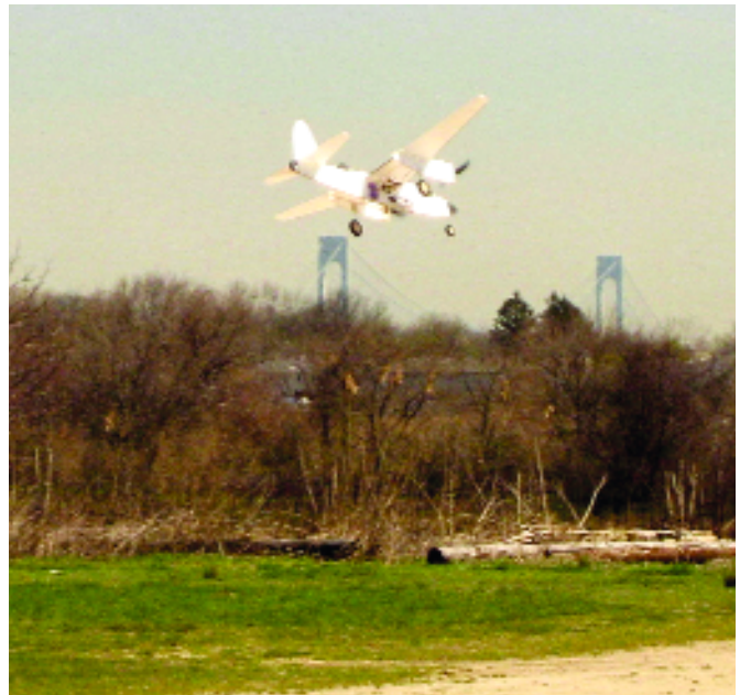
The bridge in the background makes a nice backdrop to this landing approach. Shooting a landing with a twin is fun and challenging.

Then we decided to go “first class” and built a second model using other micro components that are presently available. We chose a combination of a small receiver and two actuators: one for the rudder and the other for the elevator.