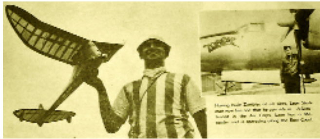
Left: Leon Shulman with his 1941 Zomby FF model in Air Trails magazine. Inset: An official Air Corps photo of a young Lieutenant Leon Shulman with the full-scale B-26 that he piloted in many missions during World War II.

Rather than cut the wing TE and angle the flap downward, as on the full-scale aircraft, Tony wanted to keep it easy. He simply added a similar section between the fuselage and the engine nacelles by taping each end onto the mating surfaces with approximately a 25° angle, thus leaving the